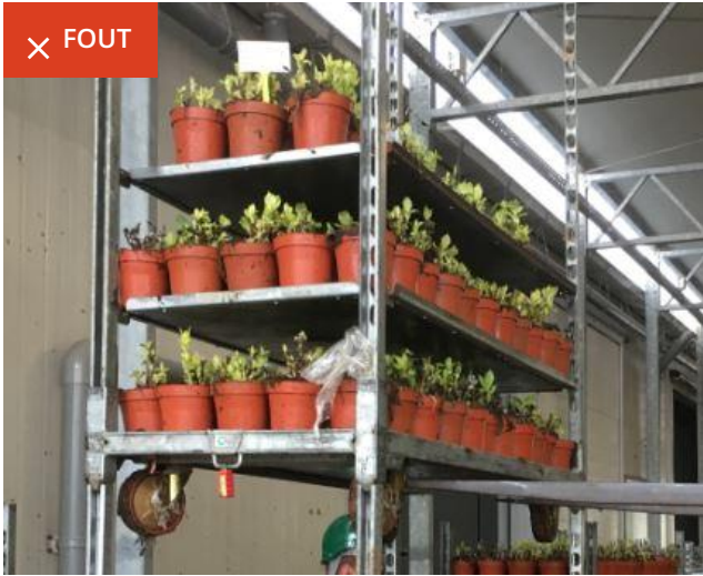
Whole DC / CC container stacked without connecting rod.